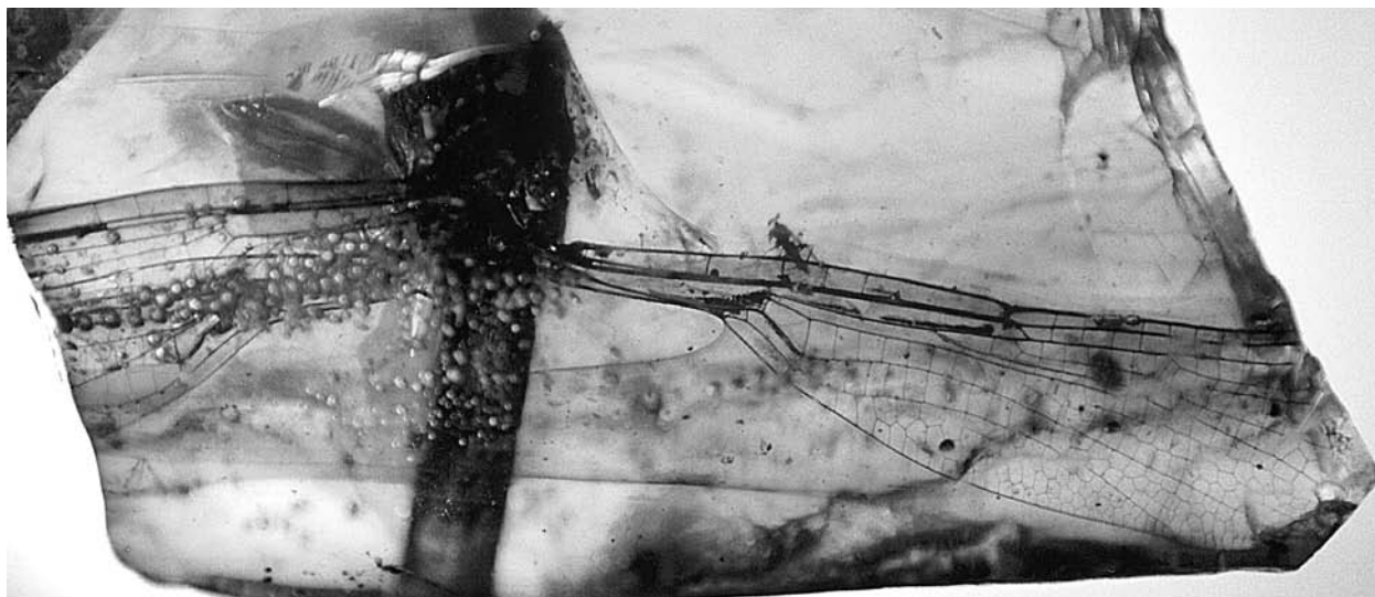
Figure 1 Electrophenacolestes serafini n. gen., n. sp., photograph of the holotype.

The Petrolestini Cockerell 1927 ( Petrolestes and Congqingia ) differ from Electrophenacolestes in the absence of secondary antenodal cross-veins distal of Ax2, between C and ScP, and in the base of IR2 in a more basal position (Cockerell 1927; Zhang 1992; Nel &