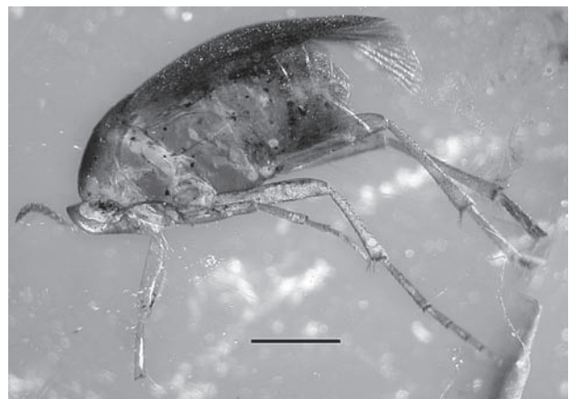
Figure 2 Macroisiagon deuvei n. sp., holotype PA 2519, photograph of the left side (scale bar represents 1 mm).

M. deuvei n. sp. is according to the traditionally used characters such as presence or absence of a pronotal process and the shape of the hind tarsomeres, easily defined as a species with absence of a pronotal process and not shortened the 2 nd hind tarsal segment. Both characters M. deuvei n. sp. shares with recent taxa M. pusillum (Gerstaecker 1855), M. ferrugineum (Fabricius 1775), M. nasutum (Thunberg 1784), M. praeustum (Gebler 1829), M. spinicolle (Fairmaire 1893) and M. axillare (Gerstaecker 1855) from the Old World as well as with some other New World species (Falin 2004). As above listed species, because of their other features, most probably do not belong to one species group, relationships of M. deuvei n. sp. with extant species of the genus are difficult to establish until revision of the genus.