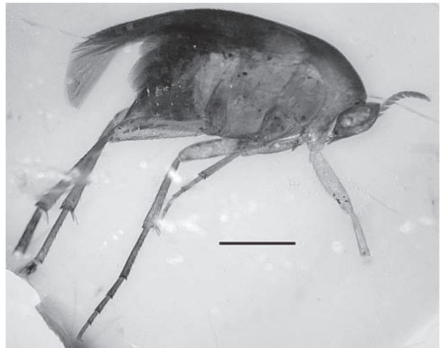
Figure 3 Macrosiagon deuwei n. sp., holotype PA 2519, photograph of the right side (scale bar represents 1 mm).

Due to the above mentioned facts and arguments we provisionally transfer the genus Paleoripiphorus